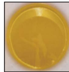
Ozone Wash No trace of the MRSA bug on the membrane